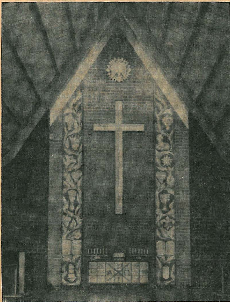
INTERIOR VIEW OF ALPINE COMMUNITY CHURCH